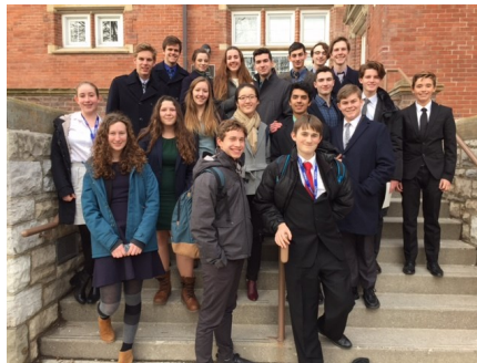
U of T Model UN Conference 2016