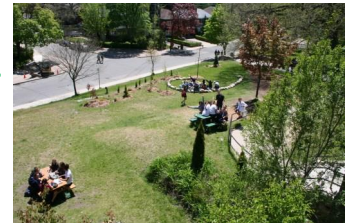
An aerial view of the Fibonacci sequence.

both the Ursula Franklin Academy community, the Bloor West Village community as well as the often invisible other components of the of the ecological web in which we live, the local flora and fauna. To this end we planted indigenous plant species and as a result, our school yard has been certified as