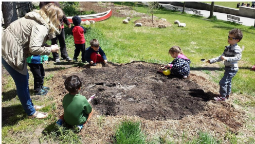
The daycare kids planting a pumpkin patch.

a Wildlife Habitat by the Canadian Wildlife Federation. The first school to receive his honour.